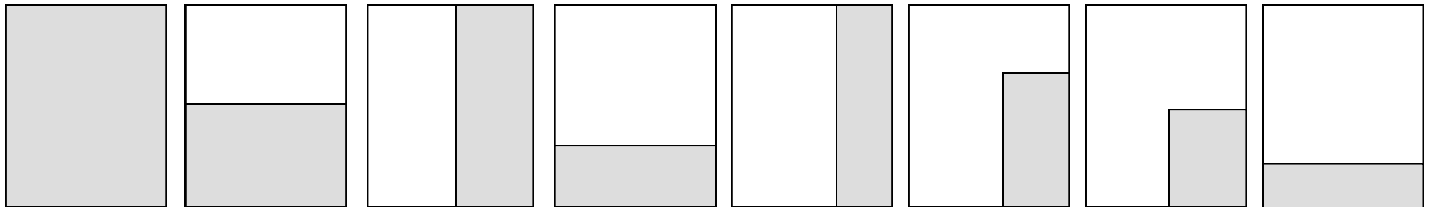
Full Page Half Page Horizontal Half Page Vertical Third Page Horizontal Third Page Vertical Quarter Page Vertical Quarter Page Quarter Page Banner